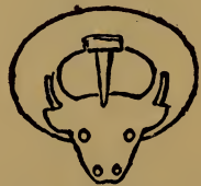
Ordinary Brave or Squaw.

The ordinary brave or squaw as soon as admitted wears the simple badge, so—